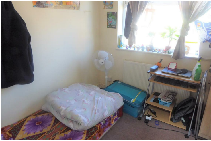
Rear aspect double glazed window, radiator.