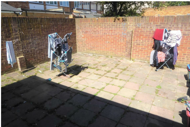
Paved patio area