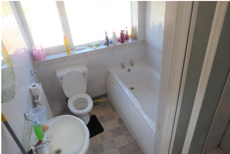
Panel enclosed bath, low level w.c, pedestal wash hand basin, shower cubicle.